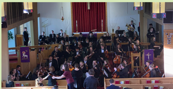
Working with students from Utah