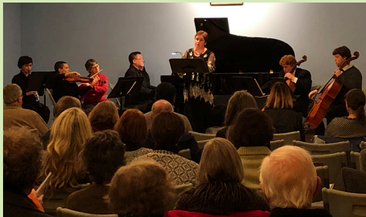
Concert in Lake Oswego