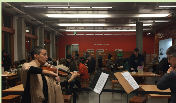
Playing at Blanchet House in December