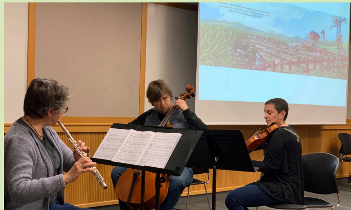
Wilsonville Library, playing and narrating Grumpy Goat