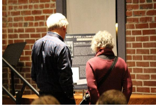
Audience members by our display boards