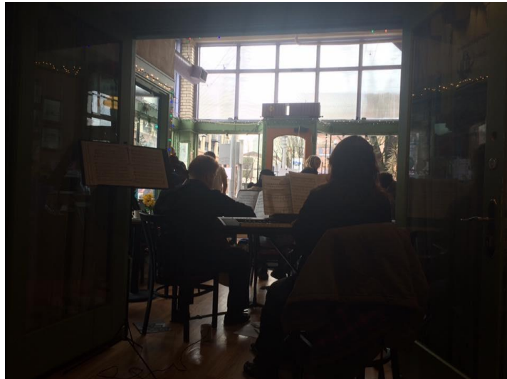
Performing in Sisters of the Road

I feel honored for the opportunity PCM had to perform for the All Saints Homeless Lunch. The crowd really enjoyed the music and many people came up to us to thank us, talk, and ask questions. Seeing the joy we helped bring to everyone there made it a wonderful experience. I hope we can make each of our performances feel as special as this one!